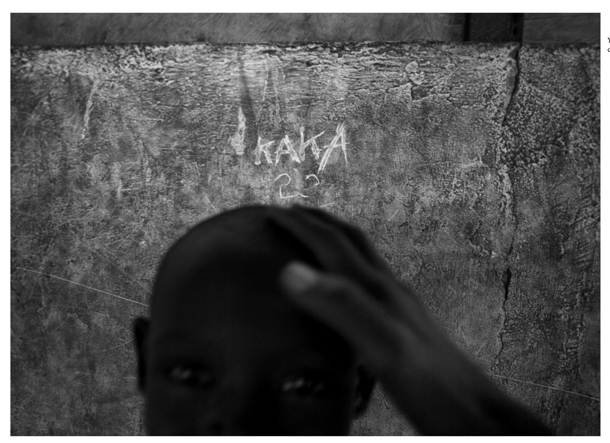
6. KIBOS, KENYA

Young boys play soccer in the almost completely abandoned courthouse in Kakuma Refugee Camp.